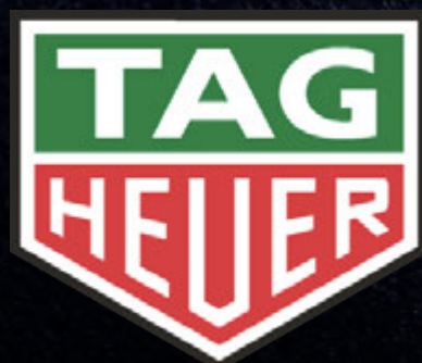
TAG HEUER CARRERA CHRONOGRAPH