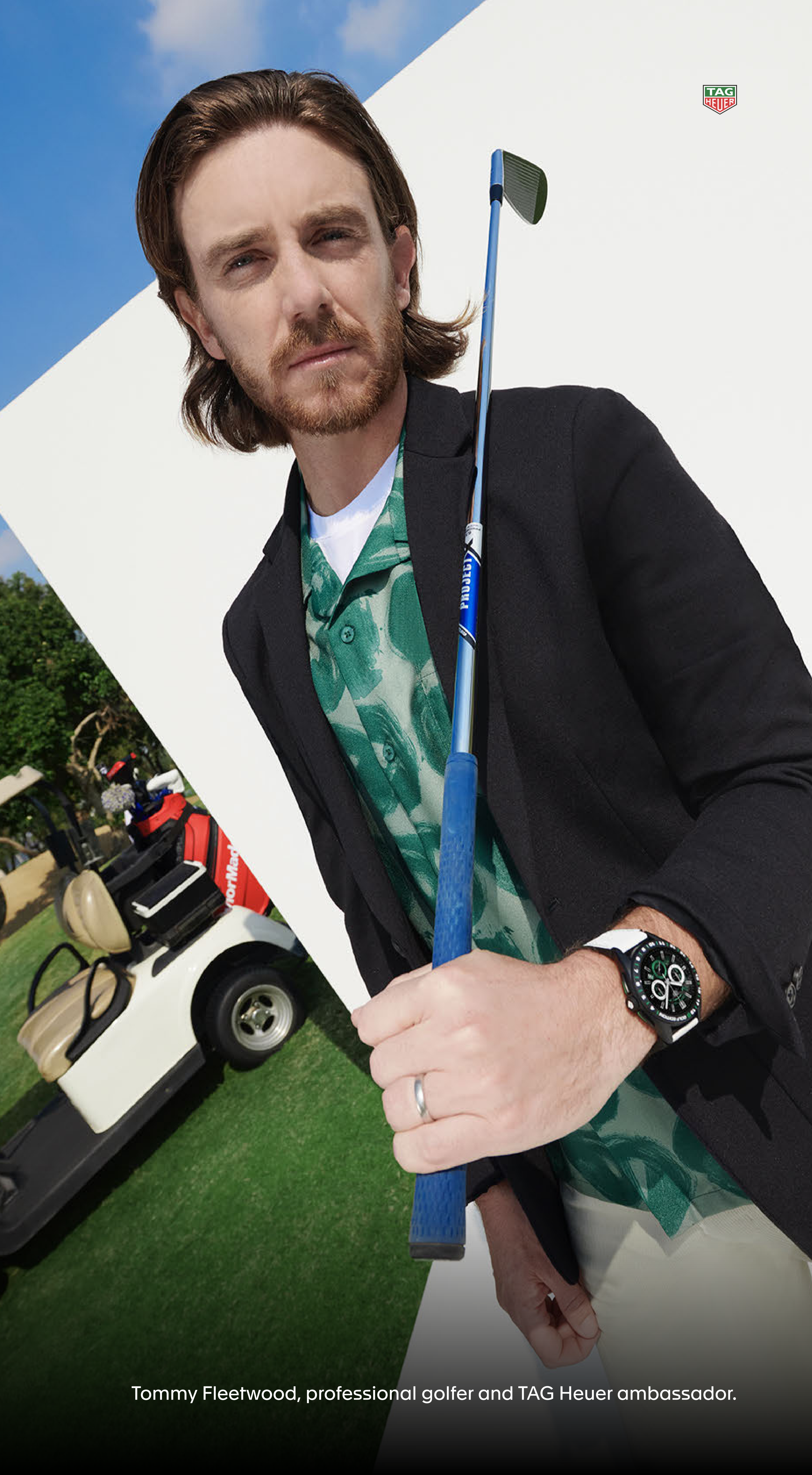
Tommy Fleetwood, professional golfer and TAG Heuer ambassador.